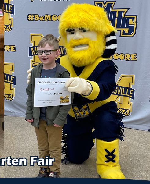
More scenes from the Kindergarten Fair